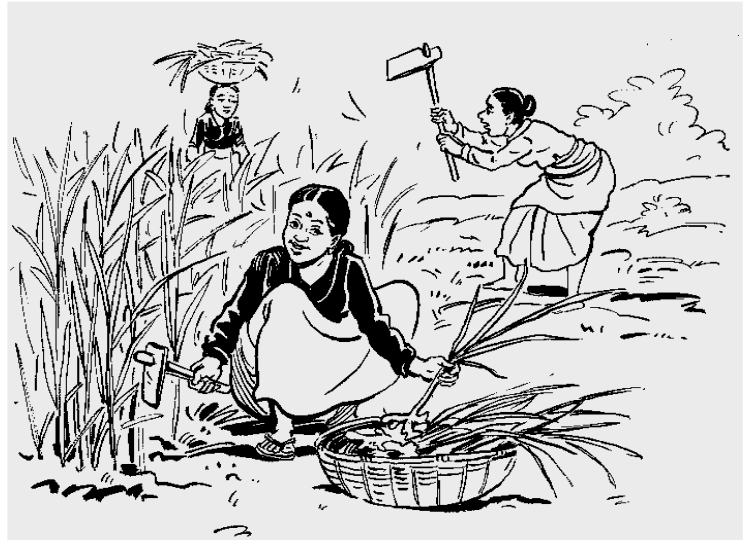
Women can earn significant incomes through ginger farming.

A woman's earnings are viewed as her input into the family income, thus she has more influence over its expenditure.