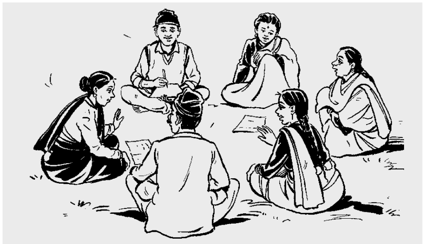
Women can speak at meeting of men and women.

Situations must be approached according to the reality of the local women.