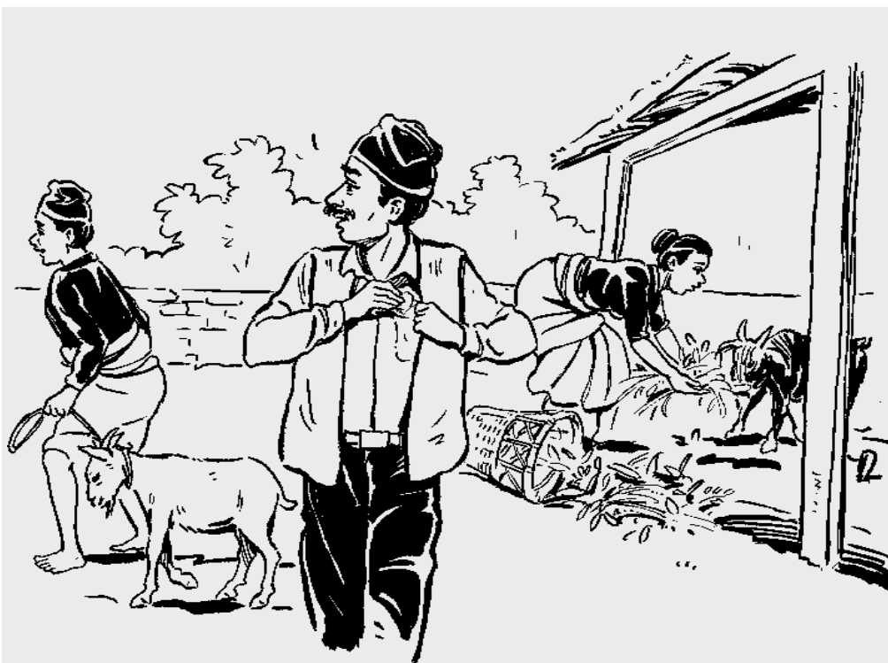
Despite a woman's contribution to household production, she has no input to decision-making or control of resources.

Women are bound by their household responsibilities.