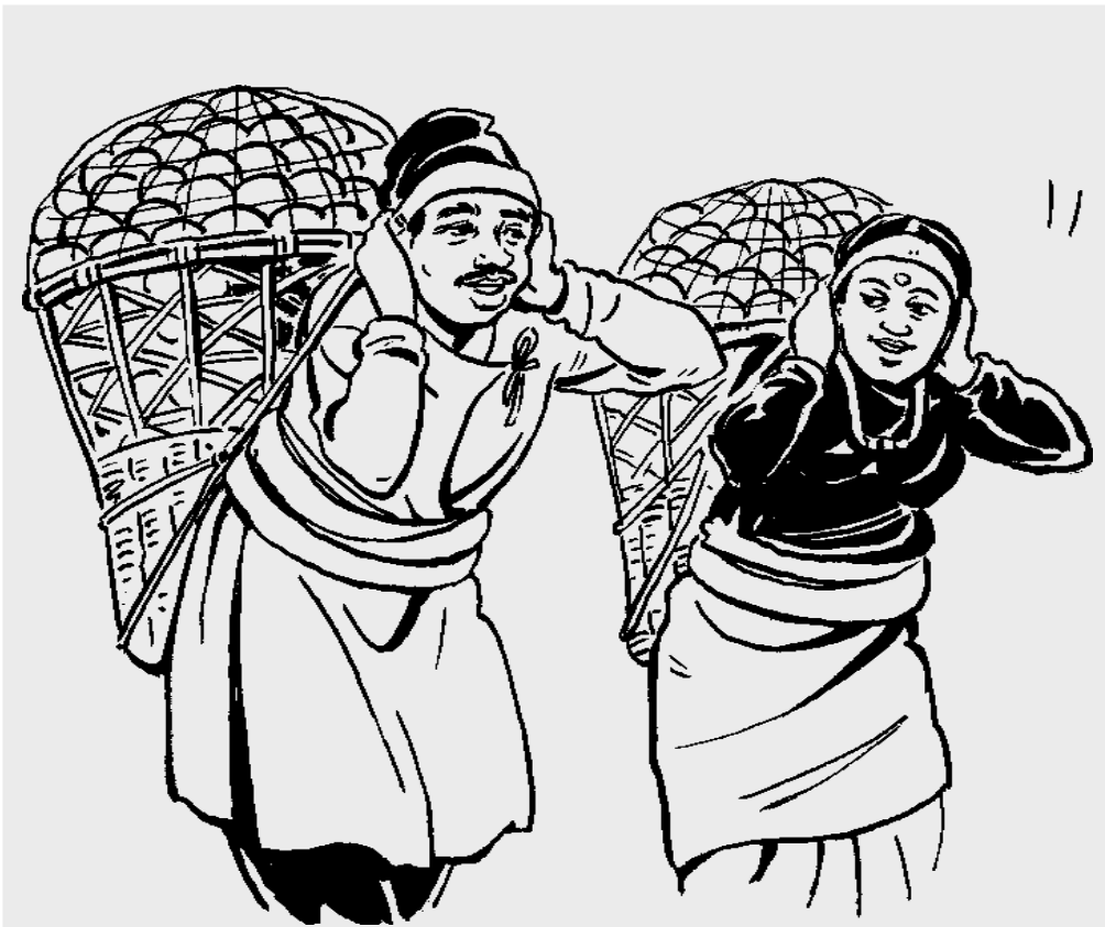
Women and men working together.

This paper explains Helvetas' context, rationale, approach, activities, outcomes, learning, and future directions.