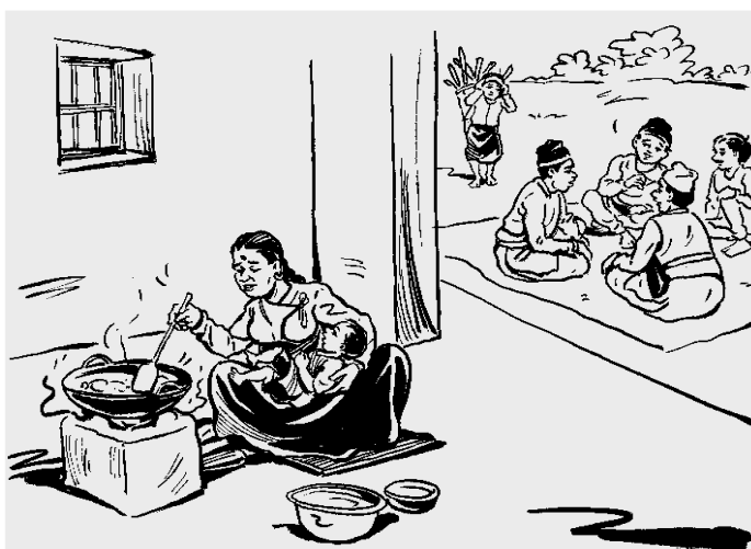
Women are burdened by household responsibilities.

Helvetas’ Lesson: Quality comes before quantity.