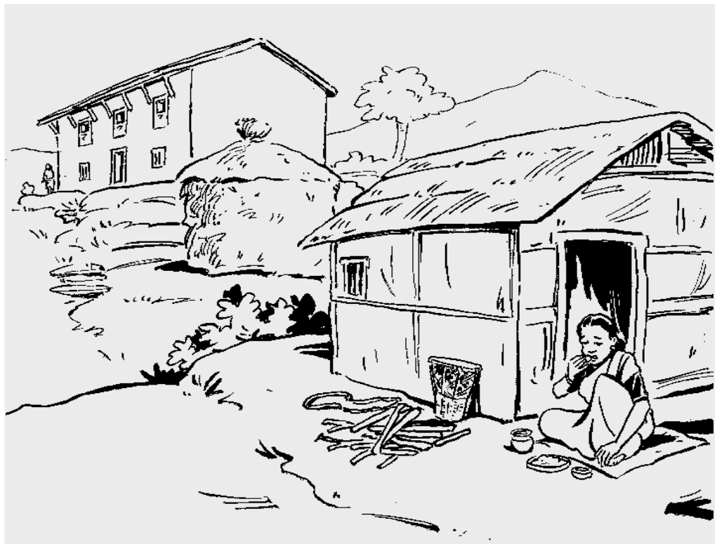
In Mid and Far West Nepal, women must stay outside of the house in a shed during her menstrual period and child birth.