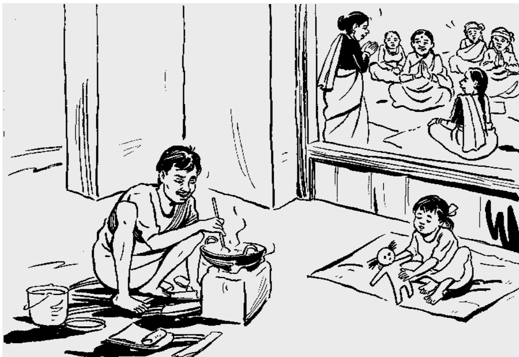
Husbands, who assist with the household chores, offer their wives an opportunity to participate in development activities.